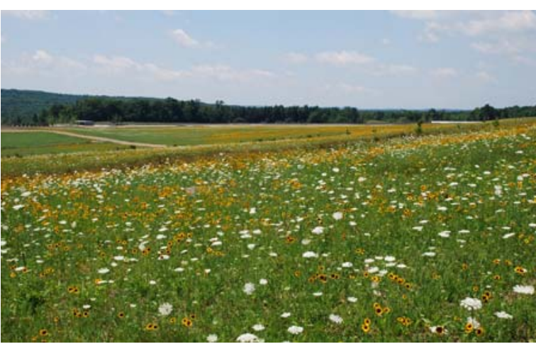
Wildflowers bloom in the Field of Honor where the Memorial Groves will be planted this summer.