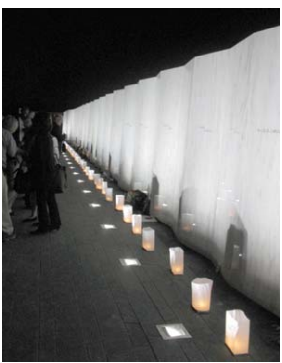
Left, visitors to the Memorial assist in the unfolding of the Flight 93 Flag. Right, Luminarias glow at the Wall of Names on September 10, 2011.