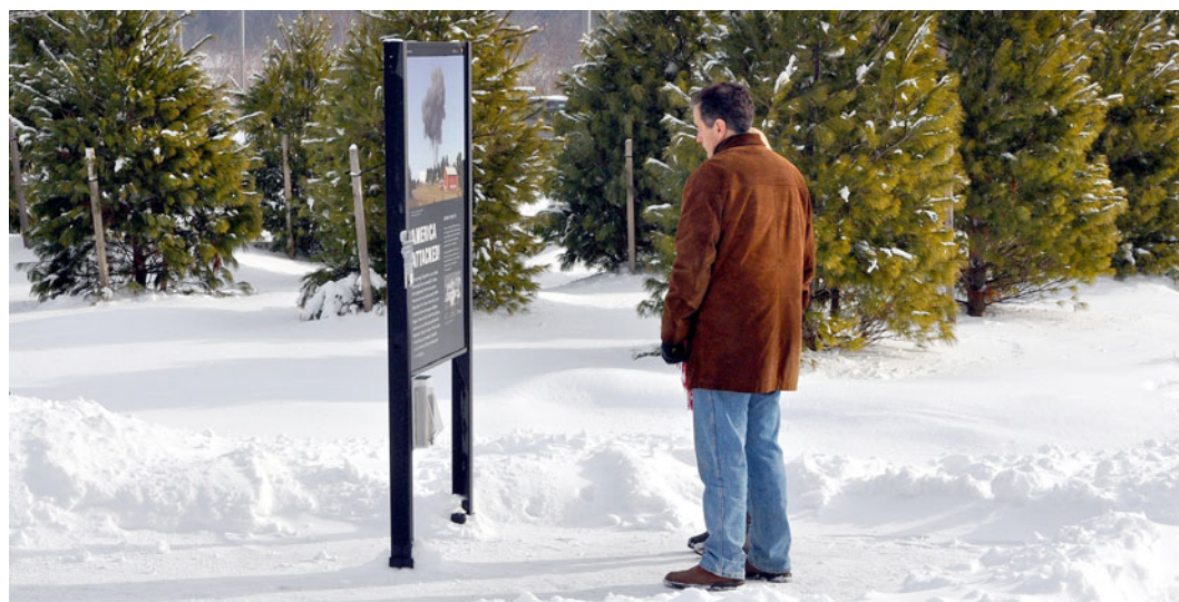
Flight 93 National Memorial is a compelling place to visit in every season. Visitation in January 2013 will exceed that of January 2012. (Chuck Wagner)