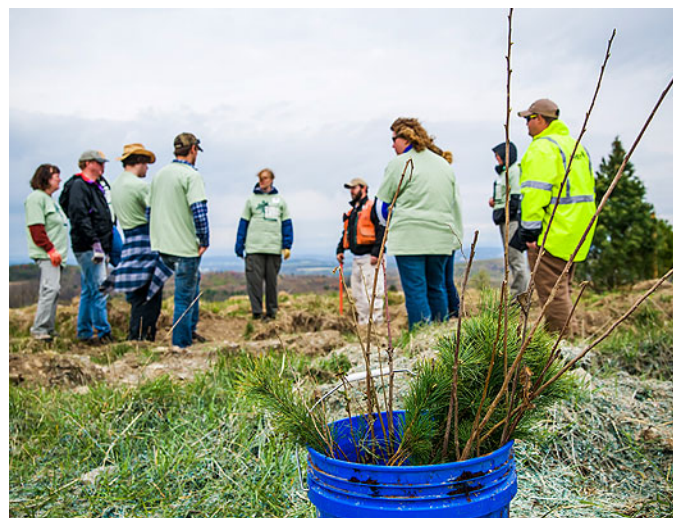
Team leader instructs reforestation volunteers at Flight 93 tree planting in April 2012.